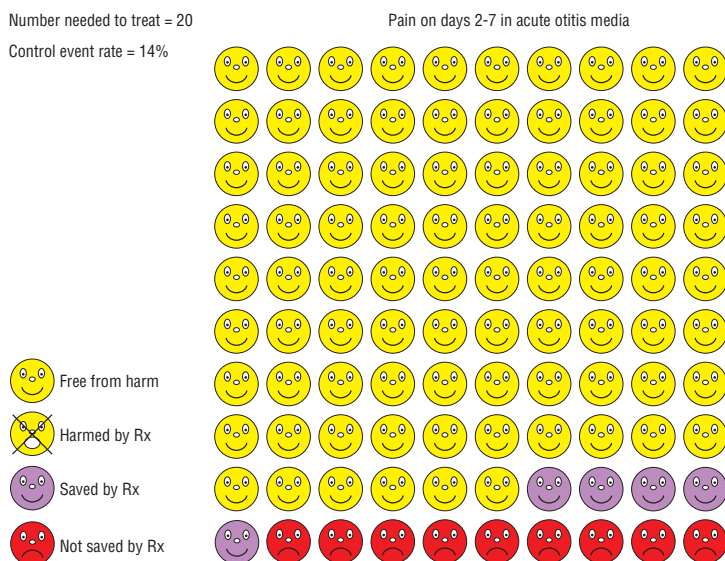
Fig 2 Portrayal of risks and benefits of treatment with antibiotics for otitis media designed with Visual Rx, a program that calculates numbers needed to treat from the pooled results of a meta-analysis and produce a graphical display of the result

The developments in how information is presented offer opportunities to put substance into commonplace healthcare discussions. But does this swing the balance away from the art of medicine? Will it become less of a "high touch" discipline, in which professionals try to support patients through episodes of illness, and more of a "high tech" one, in which reductionist approaches see pathways of illness as a series of dilem-